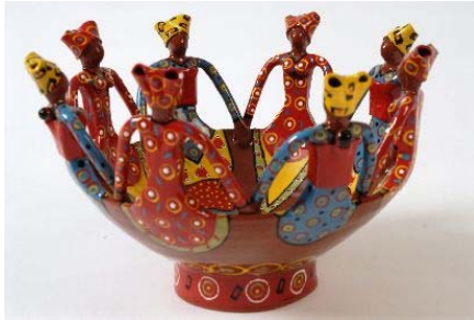
New Icons: The Bambanani bowl