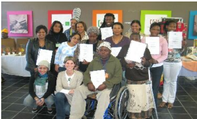
At the end of the 3-week course: the NQF2 Business and Marketing group with their certificates of attendance.