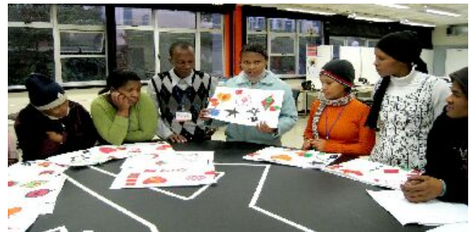
The Design and Drawing NQF2 group share their discoveries into colours and patterns.

'Every time I visited the learners on campus there was visible growth and development taking place in people. They embraced the opportunity, were enthusiastic, and put everything into their studies. People are eager to continue their learning, and are waiting for the MAPPP Seta Learnerships to start again.'