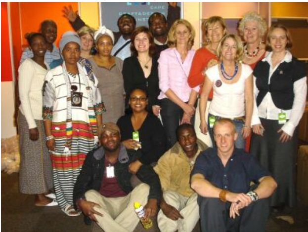
The crafters who participated on the Western Cape SA Handmade Collection stand.